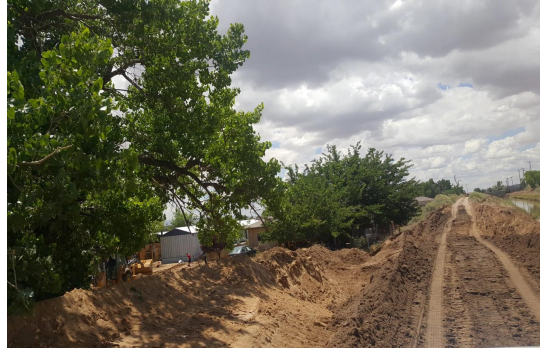
Figure 2: Belen Highline Main Canal, Sta. 1060+00±, East Bank Break Location, Restored, Looking South