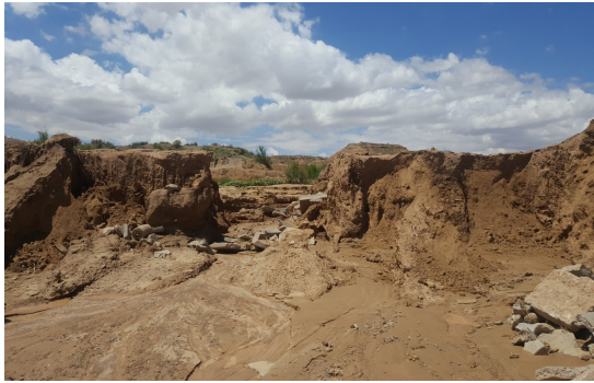
Figure 1: City of Belen Pond Breach, Looking West (Upstream)