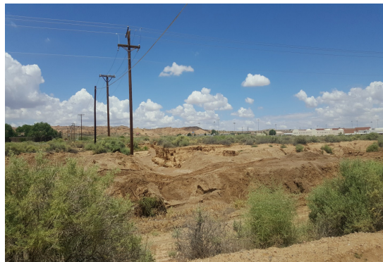
Figure 4: Belen Highline Main Canal, Sta. 1070+00±, West Bank Break Location, Looking West