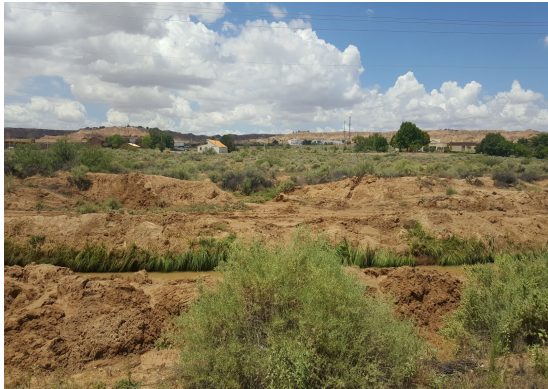
Figure 5: Belen Highline Main Canal, Sta. 1079+00±, West Bank Break Location, Looking West