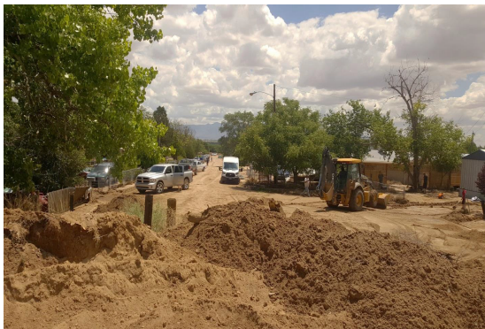
Figure 3: Belen Highline Main Canal, Sta. 1060+50±, East Bank Break Location, Restored, Looking East