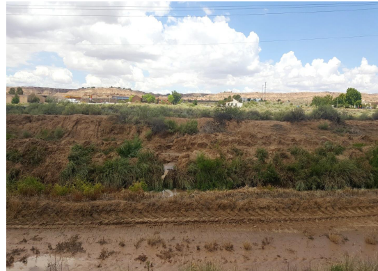
Figure 6: Belen Highline Main Canal, Sta. 1081+00±, West Bank Break Location, Looking West