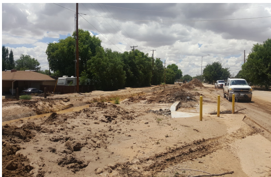
Figure 7: Sediment Removal, New Belen Acequia, Sta. 970+00±, West Bank along South Mesa Road, Looking South

h. Transmittal of Further Comments Received on SunZia Project (Informational Only) Minutes of Middle Rio Grande Conservancy Board Meeting July 9, 2018